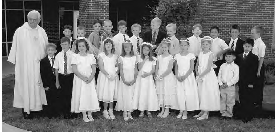
The First Communion class of 2005

The Youth Group is anxiously looking forward to the summer months. We will be prayerfully organizing all of our upcoming activities, one of which we know will be our annual Burgers Lake outing and we anticipate one of our largest groups to attend this year.